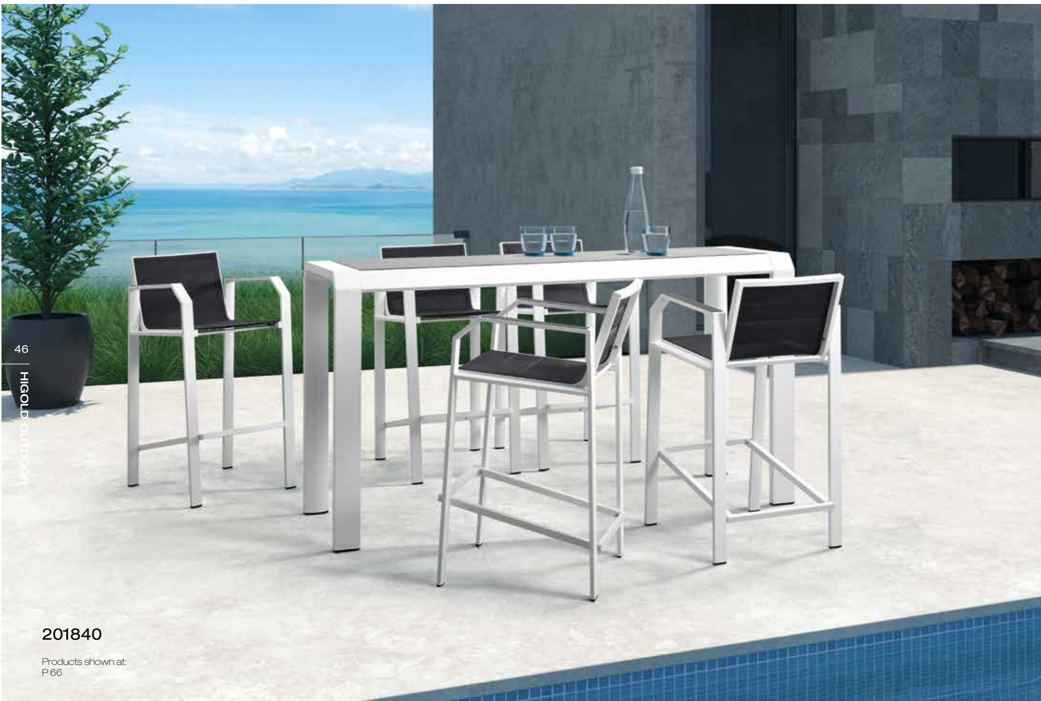
201840 Products shown at: P.66